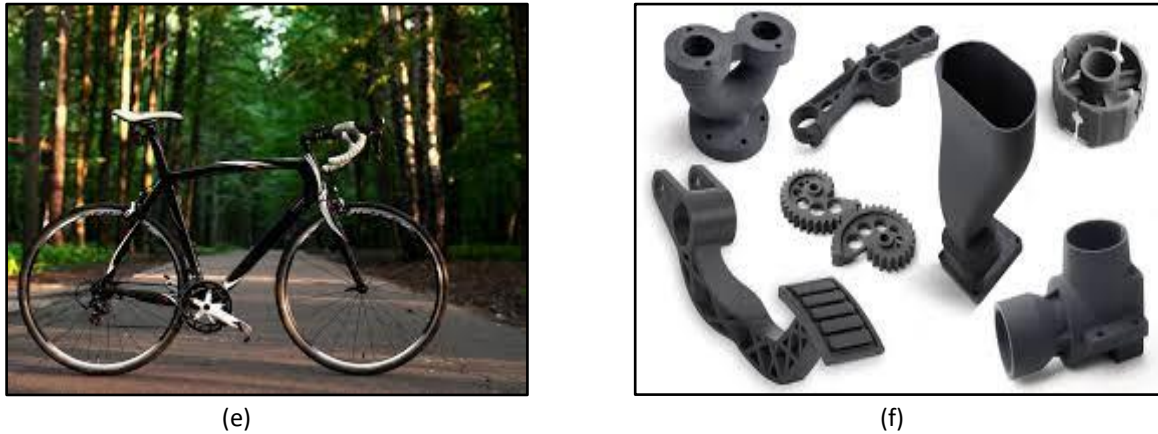
Figure 2. Applications of carbon fiber